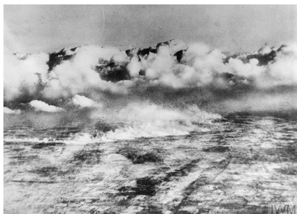
Gas Attack by the German Army on the Osowiec Fortress, Poland, during the 1st World War

Imperial War Museum IWMQ 12286 (Public domain)