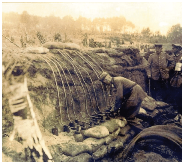
German battery of chlorine gas cylinders being prepared for an attack, awaiting the right weather conditions to prevent blowback; similar to the arrangement at Hill 60 in May 1915