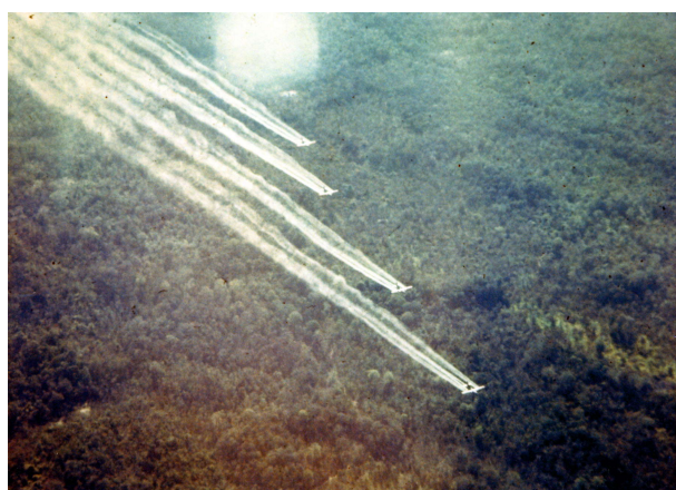
Operation Ranch Hand: Spraying Agent Orange to deny the enemy jungle cover during the Viêt-Nam war in the 1960s.

... the intentional application for hostile purposes of toxic substances against humans and their environment.