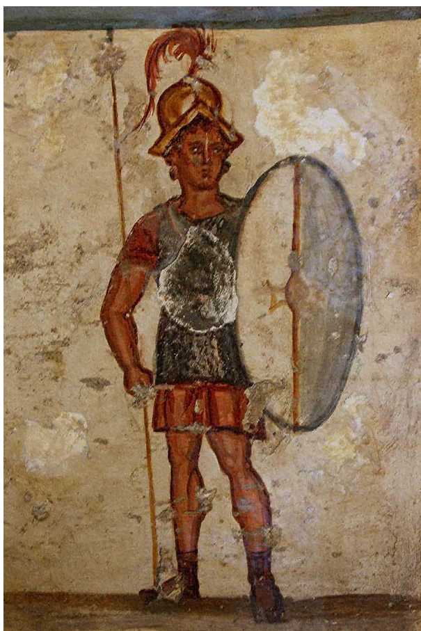
Fresco of an ancient Macedonian Greek heavy infantry soldier wearing mail armour, 3rd century BC.

Istanbul Archeology Museums (CC BY-SA 4.0)