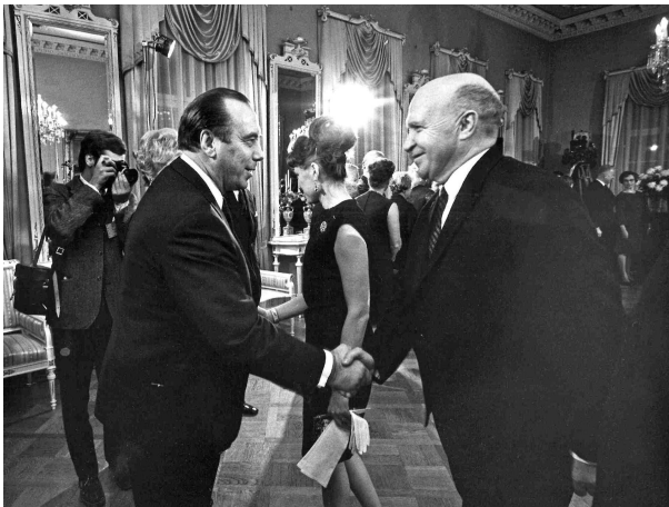
The Finnish foreign minister Väinö Leskinen and the Soviet diplomat Vladimir Semyonovich Semyonov shake hands at the SALT I negotiations in Helsinki. The negotiations lasted from 1969 to 1972.

After the US had proposed to the USSR to launch negotiations on the prohibition of ballistic missile defences in 1966, the Strategic Arms Limitation Talks (SALT) between the US and the USSR started in 1969 (Helsinki, Finland). Part of this first SALT process were formal negotiations of an ABM Treaty.