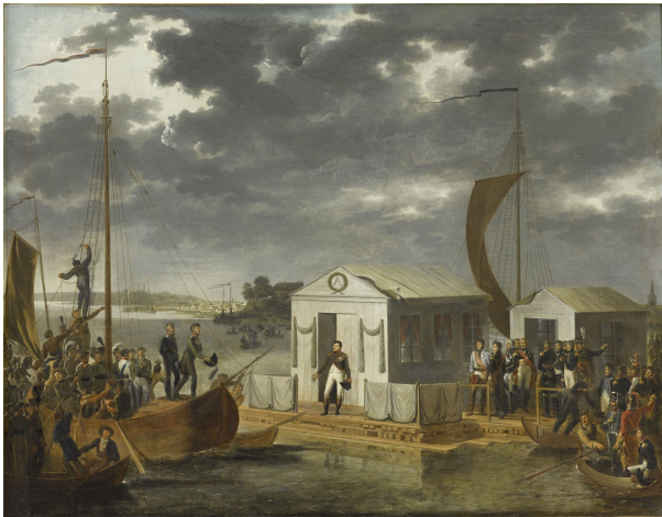
Meeting of the Napoleon I of France and Alexander I of Russia in a pavilion set up on a raft in the middle of the Neman River.

In 1808, two Franco-Prussian Treaties (also known as the Treaties of Tilsit) were signed, by which the Prussian army was limited to 42,000 troops for a period of 10 years from 1 January 1809 and Prussia was stripped of about half its territory.