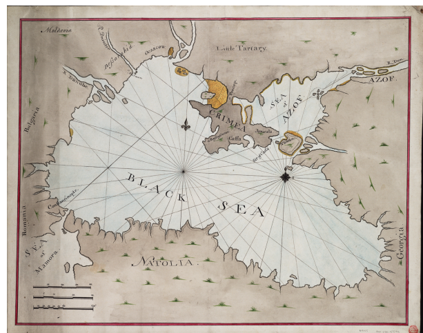
An early 19th century map of the Black Sea. National Maritime Museum, Greenwich, London

The treaty made the Black Sea neutral territory, closed it to all warships and prohibited fortifications and the presence of armaments on its shores.