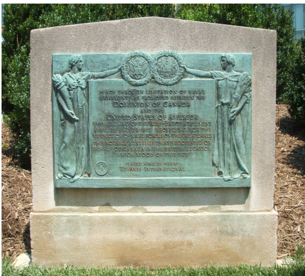
Historical marker for the Rush-Bagot Treaty in Washington, D.C., where the Rush-Bagot Agreement was negotiated.

The agreement between the US and Great Britain led to the naval demilitarisation of the Great Lakes and Lake Champlain region of North America. Under the Agreement, each side was permitted to deploy a maximum of one ship on Lake Ontario, two ships on the Upper Lakes and one on Lake Champlain, and none could exceed one hundred tons and one eighteen-pound cannon.