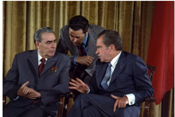
US President Richard Nixon and Soviet General Secretary Leonid Brezhnev – still in a good mood in 1973.

[ https://web.archive.org/web/20140502005429/http://cns.miis.edu/inventory/pdfs/aptsaltI.pdf ] is signed for a period of five years.