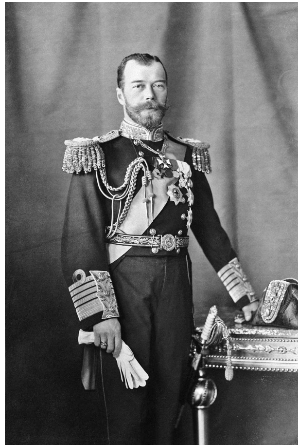
Tsar Nicholas II of Russia initiated the Hague Peace Conference of 1899.

The conference led to the signing of the Hague Convention of 1899. This Convention consisted of three main treaties and three additional declarations, which together established rules for declaring and conducting warfare as well as the use of modern weaponry and set up the Permanent Court of Arbitration