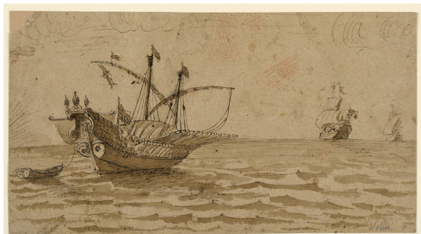
18th century war ships at sea.

Both states mutually declared that neither side would prepare any naval armaments beyond the peacetime establishment, both would limit their number of naval ships placed 'in the water,' and both would agree to provide preliminary notification if some different arrangement was found necessary.