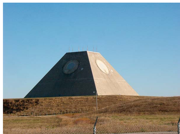
A Safeguard Missile Site Radar, built to defend US missile bases.