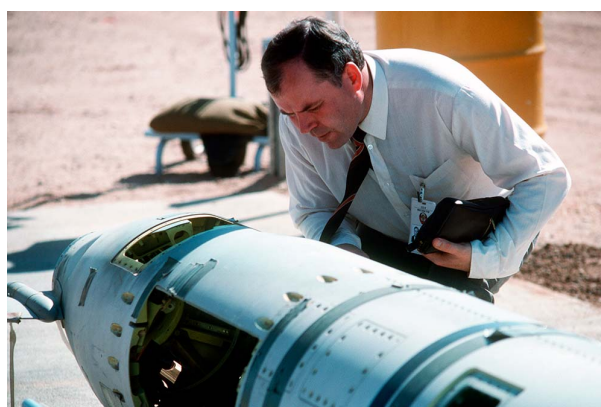
A Soviet inspector examines a BGM-109G Tomahawk ground launched cruise missile (GLCM) prior to its destruction.

In the second case, along with the Conventional Forces Europe Treaty (CFE; 1990) and the Vienna Document (VD; 1990, updated in 2011), the Open Skies Treaty (OST, 1992) constituted a mutual reinforcing framework of arms control and confidence and security building measures (CSBMs) in Europe.