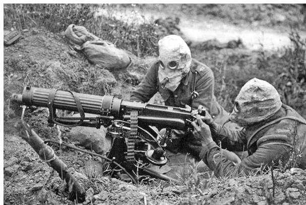
A British machine gun team wears anti-gas helmets in WWI.

and technological innovations in the field of infantry and artillery had been decisive factors in the outbreak and longevity of hostilities.