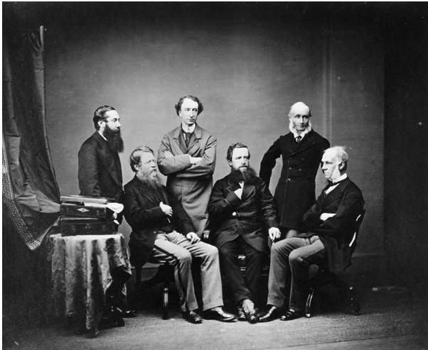
The British High Commissioners for the Treaty of Washington group for a picture.

The treaty between Great Britain and the US, leading to total demilitarisation and inaugurating permanent peaceful relations between the US and Canada, and the US and Britain.